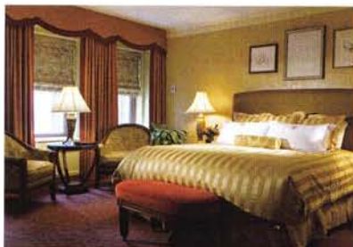
The Brown Palace Hotel opened in 1892.

■ JW Marriott Denver Shoppers especially delight in this upscale hotel’s tony Cherry Creek North location. Its 196 rooms are